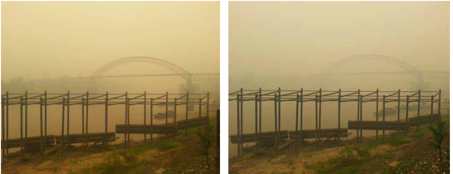
Figure 2: Visibility due to smoke/haze on consecutive days at Murung Raya regency

In education issues, Cokal continued its support for Tumbang Tuan Junior High School (nearest school to BBM site) through the sponsorship of 3 local teachers. This programme is being implemented in conjunction with the local Education Department.