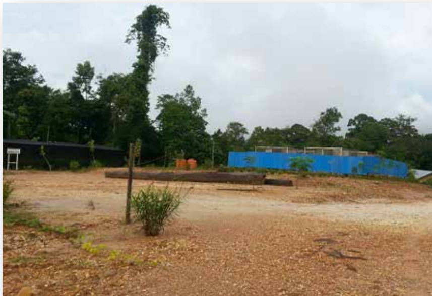
Figure 4: Completed holding cages compound at Krajan (BBM Mine site) approximately 150km from the released area