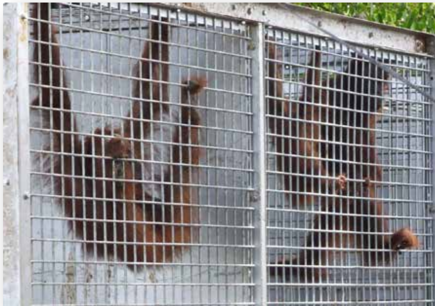
Figure 5: Orang Utan in transit cages prior to release

Cokal also continued the School Tree-Planting Programme during the quarter. This programme aims to provide the local schools in the Project area with plants from the on-site nursery to be planted in the local villages. Cokal aims to have a total of 5,000 plants established through this program, and continuing through the life of the project.