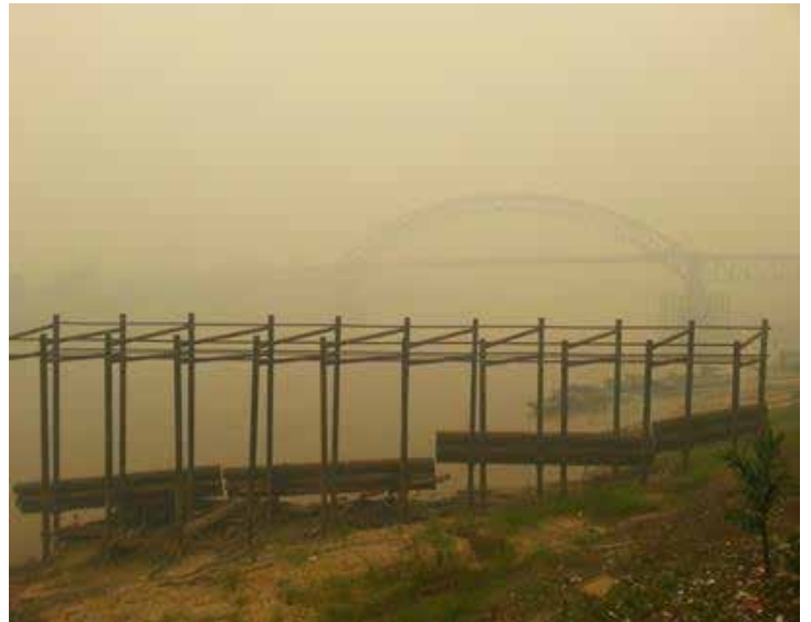
Figure 2: Visibility due to smoke/haze on consecutive days at Murung Raya regency

In education issues, Cokal continued its support for Tumbang Tuan Junior High School (nearest school to BBM site) through the sponsorship of 3 local teachers. This programme is being implemented in conjunction with the local Education Department.