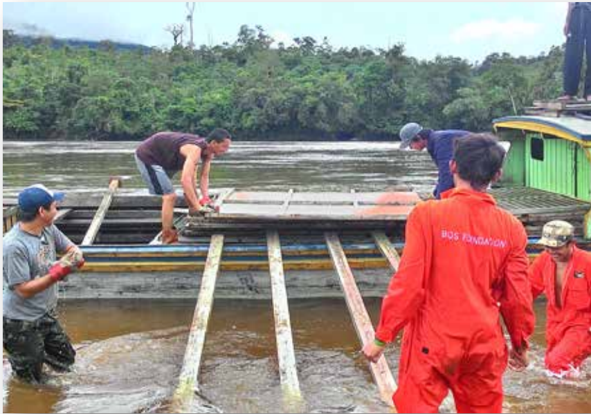
Figure 3: Unloading holding cages with BOS Foundation