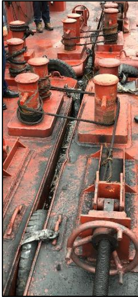
Joining Four Barges