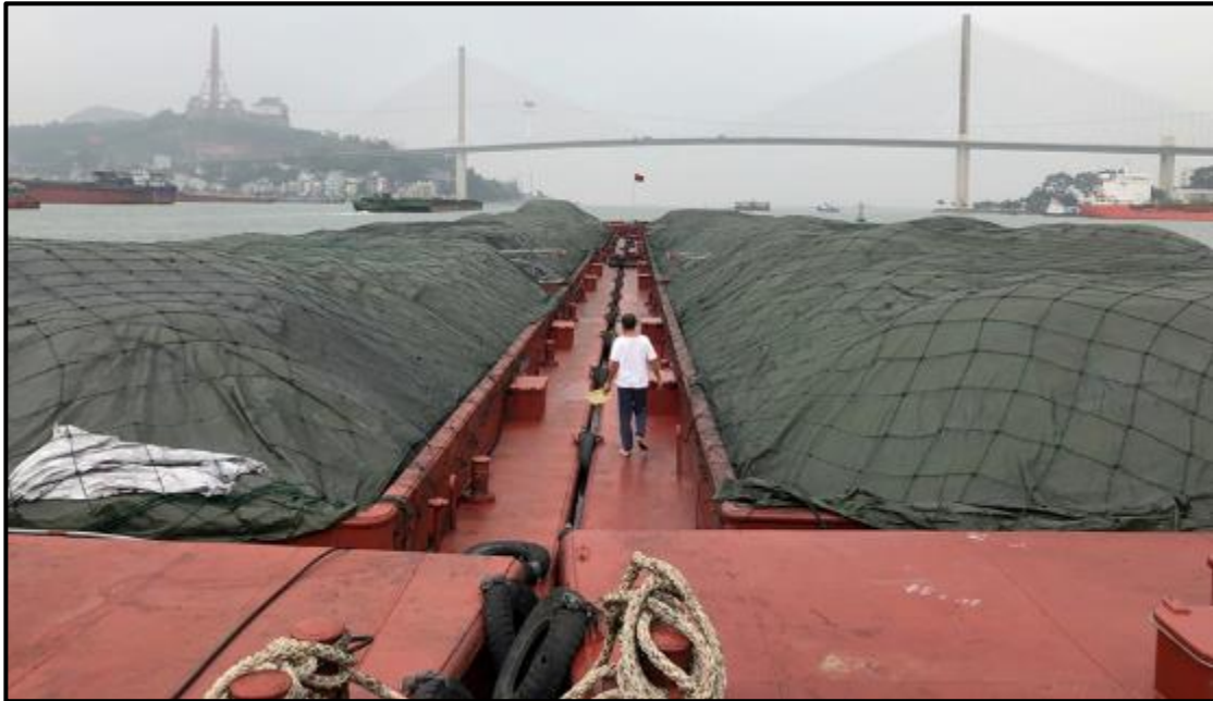
Four Shallow Draft Barges – 1,750 tonne Capacity each.

It is intended that the proposed cooperation with the Vietnamese barge company will include Meratus Advance Maritime (MDM) with whom Cokal has had a long standing relationship.