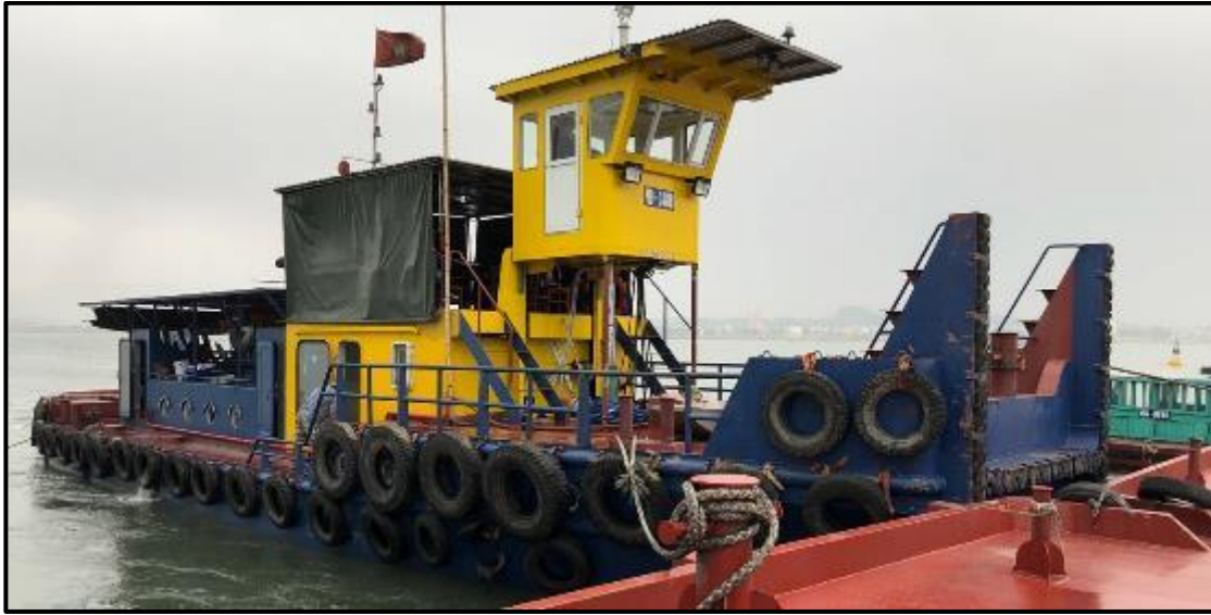
Shallow Draft Push Boat