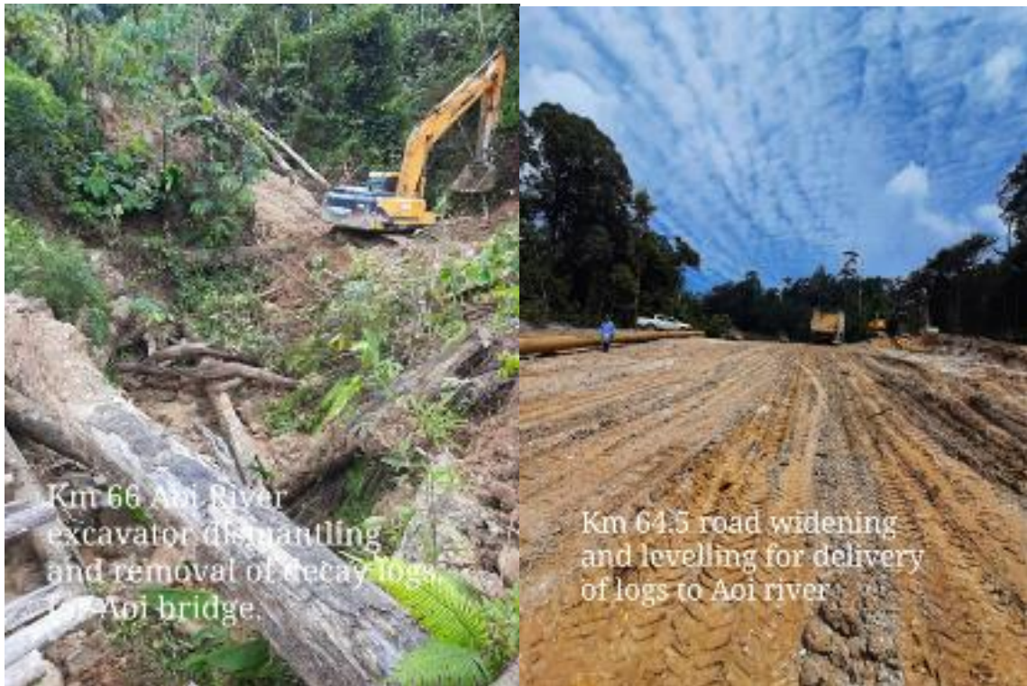
Korot River Bridge at km 64.5