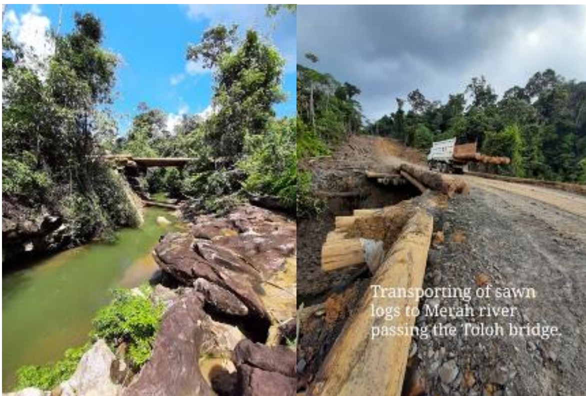
Toloh River Bridge; Logs Trucked to Merah River Bridge

Progress on the road from km 52 into Pit 3 at BBM has been progressed with a number of bridges and culverts being constructed. Additional equipment has been mobilised to increase the rate of this progress.