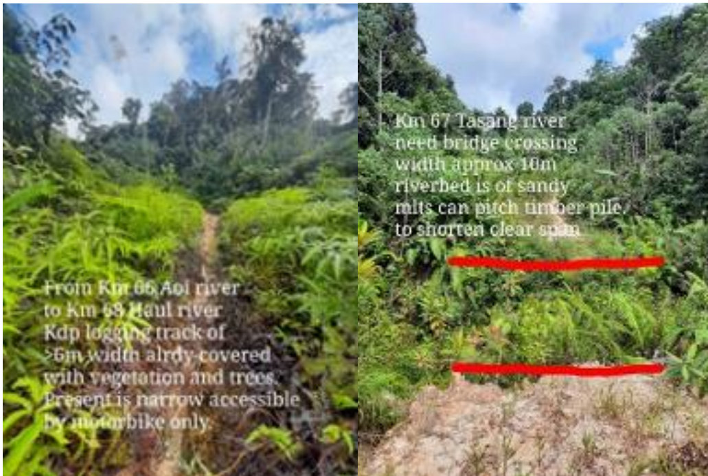
Aoi River (km 66) and Tasang River (km 67) Vegetation to be Cleared