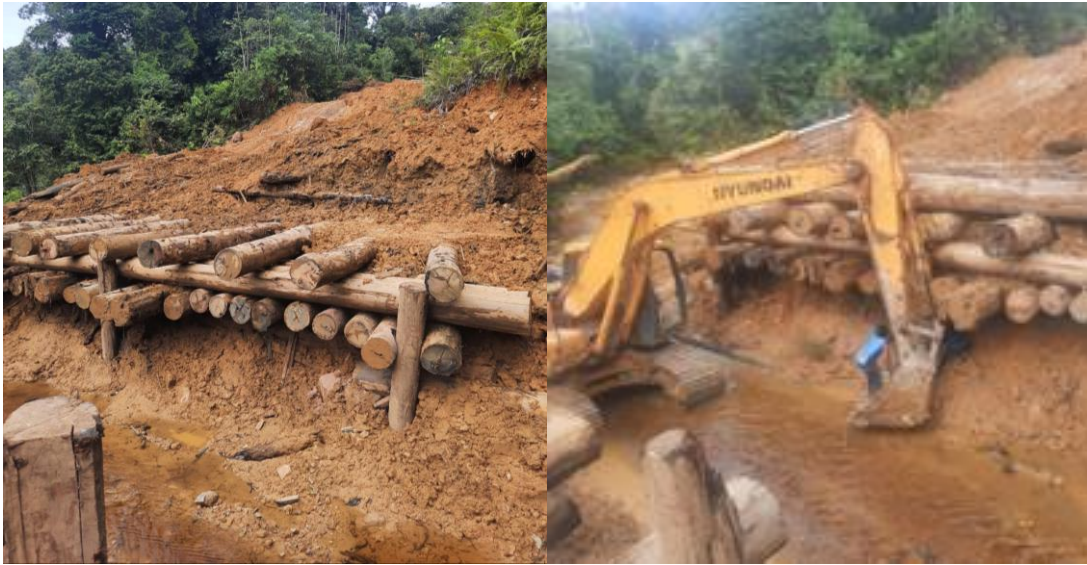
Merah River Bridge Abutment Construction